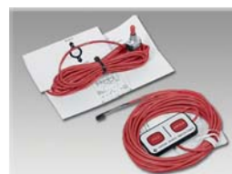
◀ 04805-000 Dash-Mounted Toggle Switch (Fold/Unfold)