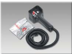
◀ 04853-000 Replacement Handheld Control