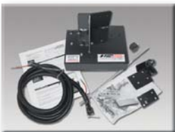
Slide Door Operator