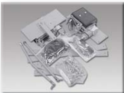
Swing Door Operators