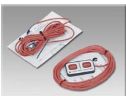
◀ 04865-000 Dash-Mounted Toggle Switch (Stow/Deploy)