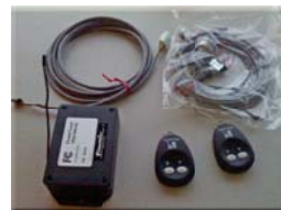
◀ 36646KS Remote Control System with Keychain Transmitter 35150KS Keychain Transmitter